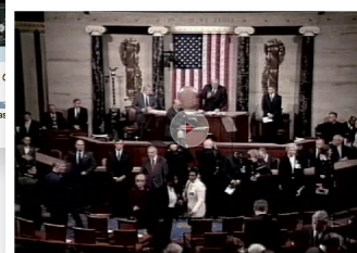
Excerpt from: Government & Public Administration (Cambridge Educational) Many government and public jobs require leadership and communication skills, developing and maintaining trusting relationships, and supervision and presentation skills. Many jobs require special training or advanced degrees. © 1/85 ©