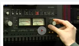
Excerpt from: The Arts, Audio Visual Technology & Communications Career Cluster Broadcast technicians work in the background, install, maintain electronic equipment used in the broadcast industry. © 3/85 ©