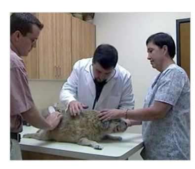
Animal Health, Nutrition, and Disease—covers basic animal care; nutrition; caring for elderly, exotic, and orphaned animals; and other topics.

infections and flea and tick infestations, as well as crucial technical skills such as collecting blood, urinalysis, administering anesthesia, performing euthanasia, and monitoring blood pressure.