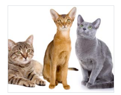
Animal Anatomy and Physiology covers small animal A&P including felin

A&P, including feline and canine breed identification.