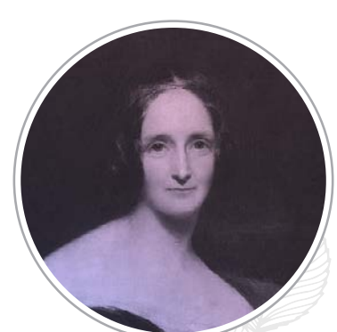
MARY WOLLSTONECRAFT SHELLEY

"No person is your friend (or kin) who demands your silence, or denies your right to grow."