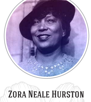
"It's no use of talking

my strengths and limitations are and work from a true place."