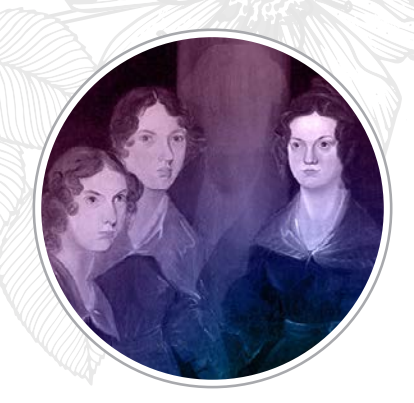
THE BRONTË SISTERS

"We dream to give ourselves hope. To stop dreaming—well, that's like saying you can never change your fate." The Hundred Secret Senses