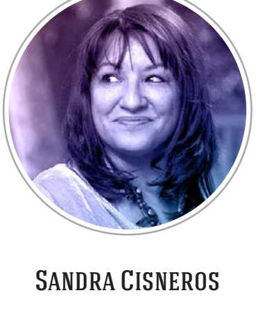
"I have to understand what

"If there's a book that you want to read, but it hasn't